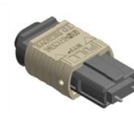
Beige MM 62.5um