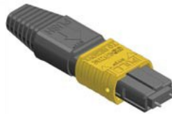
Yellow SM 9um