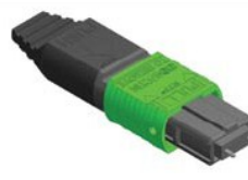
Green SM 9um