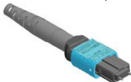
Aqua MM 50um